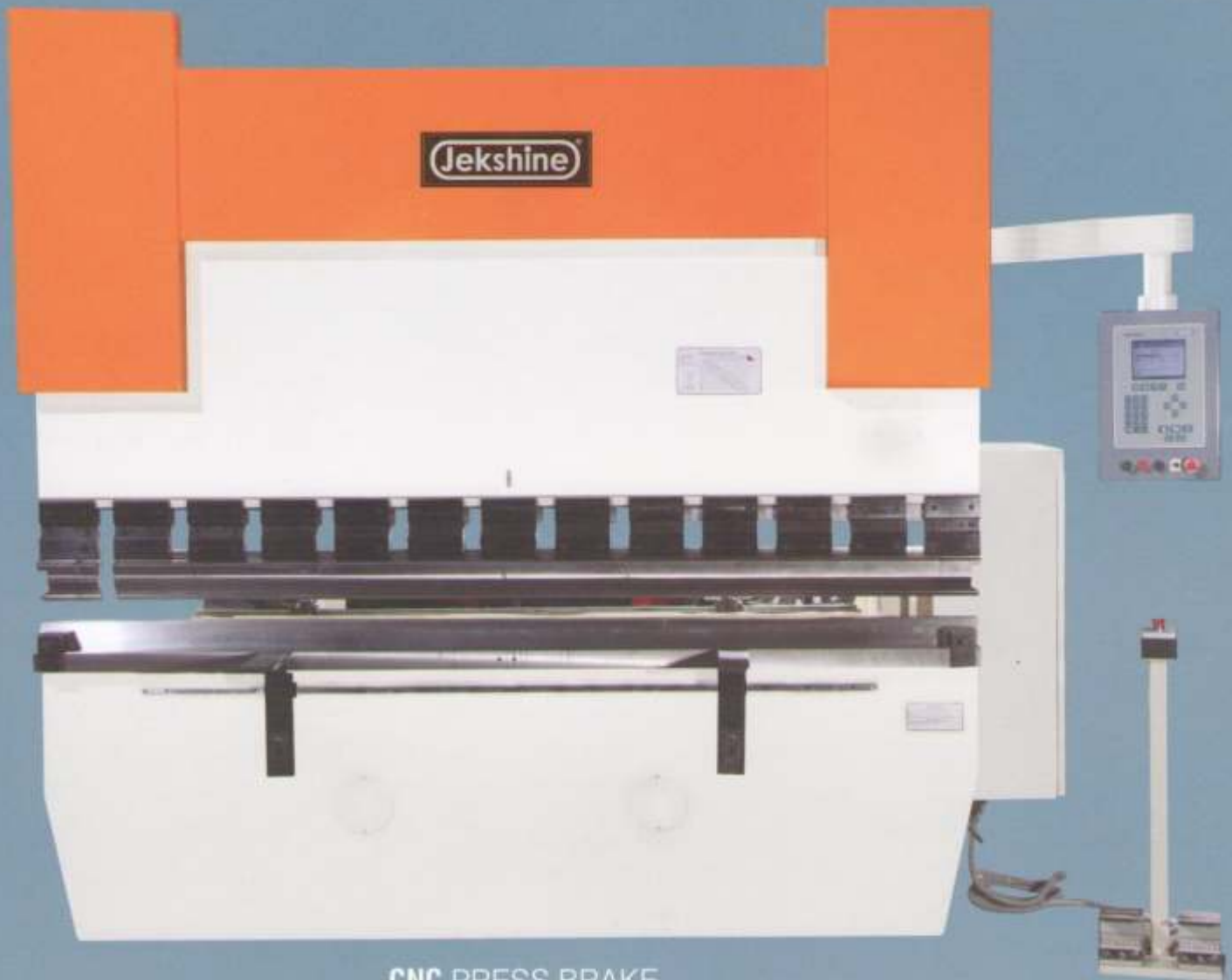
CNC PRESS BRAKE

80 to 500 Ton Hydraulic CNC Press Brake 1500 mm to 6000 mm Length